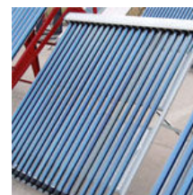
Complete Solar Hot Water Heater Kits