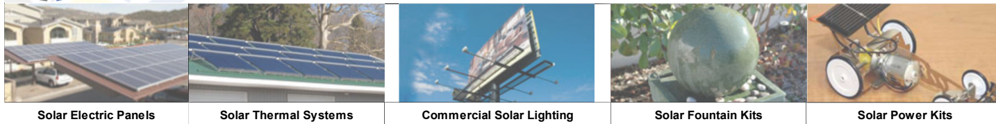
Solar Electric Panels

Call Us Today! 1.800.786.0329 8:30AM-10:30PM EST NEW HOURS!