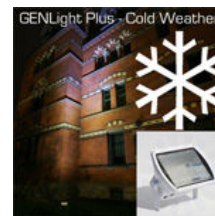
54 LED Solar Sign & Flood Light